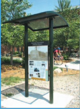
Denver's colorful history is told through a series of interpretive signs along the Greenway.