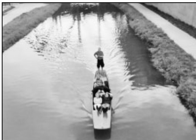
Passengers enjoy a relaxing punt ride along Cherry Creek in LoDo.

We are also expanding our group reservation program. With a minimum reservation of 2 boats, you and your friends can come down for a boat ride anytime of day on any day of the week except Monday when we are closed. We take groups of every kind and also offer private parties. With our group ride you can even decide where along our route you would like to be picked up and dropped off. You could start at Confluence Park, take a boat to Larimer Square for lunch, and then hop on the boats again to get back to your car. We work with each group to create a personalized boating experience.